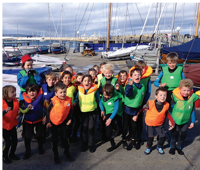
NYC Nippers 2015

Possibly the biggest surprise this year has been the popularity of the midweek nippers with a record breaking 24 kids taking part in 2015. It ran every Wednesday evening, and with the help of nice weather it proved to be an immense success with plenty of very young enthusiastic sailors!