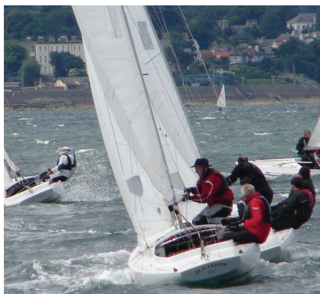
Dragons at speed