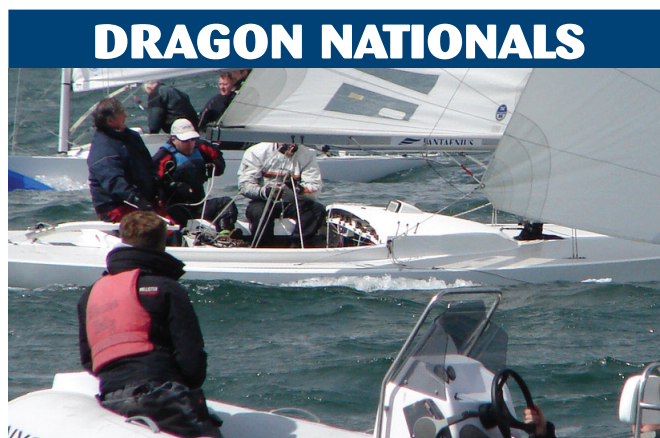
Dragon Nationals hosted by NYC in June were a great success