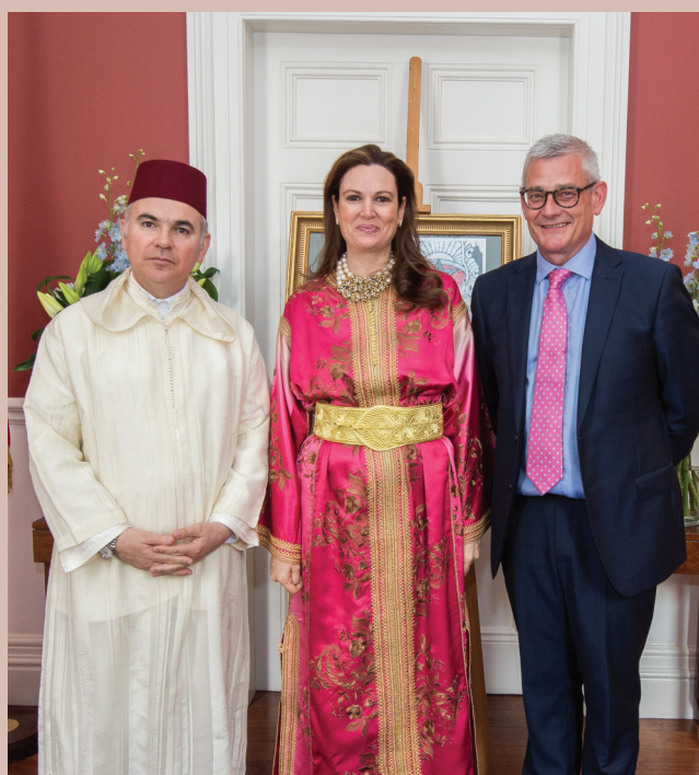
Manager welcomes Moroccan Ambassador and his wife to the Club for Morocco National Day celebration