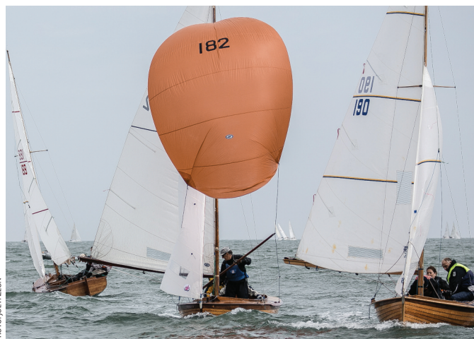
Sailing Heritage is kept alive with wonderful classes such as the Mermaid and Water Wags taking part in the Volvo Regatta