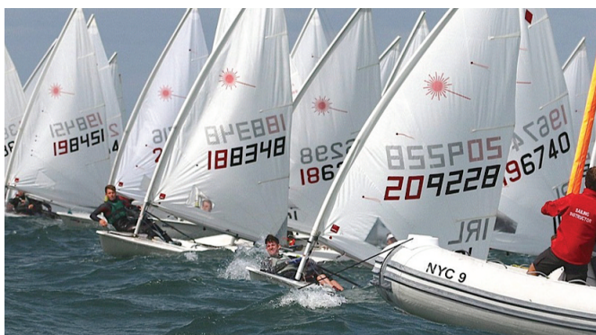
Laser Nationals Start

DBSC Davy Cruiser Challenge was under way at time of going to press. The Club is delighted to welcome Davy as sponsors of the event, as it enables us to run a really professional event. Representatives from Davy have attended a number of functions at The National already, and we hope to keep them aboard into the 2016 season.