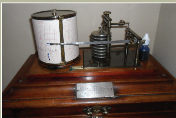
Club Baromotor, dating from 1903, is still in perfect working order, maintained by Club member Sean Nolan

There is a huge amount of very interesting information and history out there among our members and if anyone feels they can contribute some information on an individual item we would be delighted to hear from them.