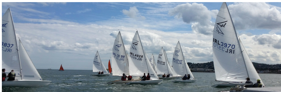
Flying Fifteens Captain's Race in Scotman Bay

The Rugby World Cup is the highlight of the Autumn sporting calendar and the Club will be showing all the matches live. There will no doubt be a fantastic atmosphere around this event and we would encourage you to come to the Club and join in the fun.