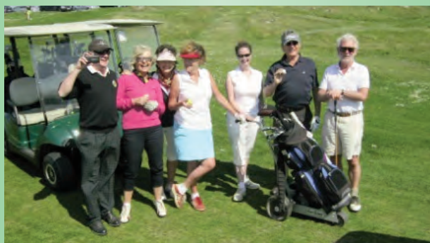
Happy golfers on the first tee!

W e played the Ballyconneely course in October 2011 in strong windy conditions, and managed to dodge all the rain which was forecast. This time though, it was different.