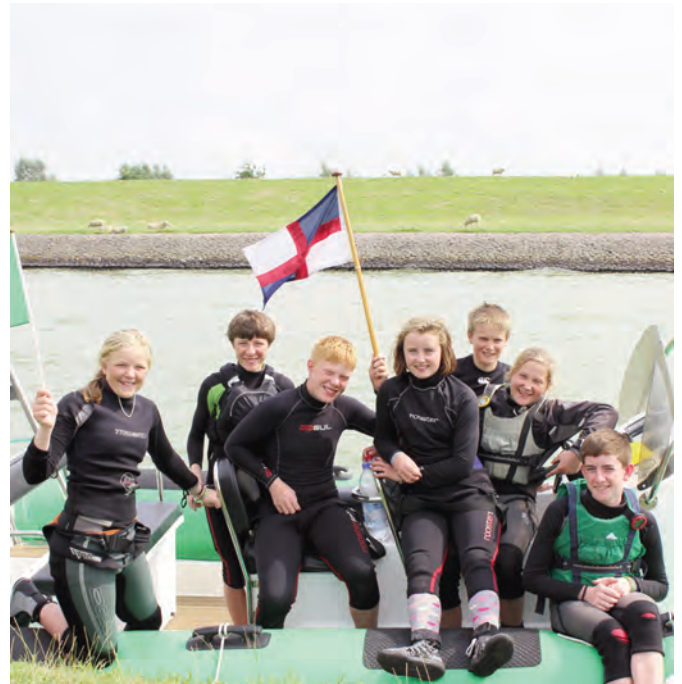
NYC kids at Topper Worlds in Holland