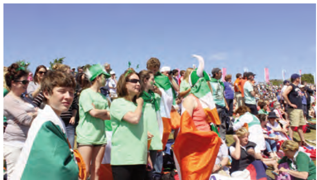
NYC supporters on Murphy's Mound in Weymouth