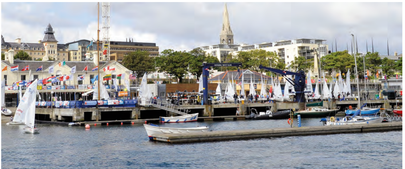
ISAF Four-Star-Pizza Youth World Sailing Championships at NYC