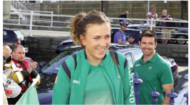
Annalise Murphy and Matt McGovern (49er) pass the RNLJ/Junior Section guard of honour at the Irish Sailing Team welcome home party