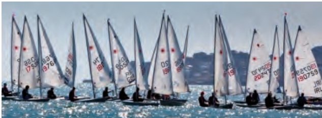
Lasers enjoy the sunshine at Mitsubishi!