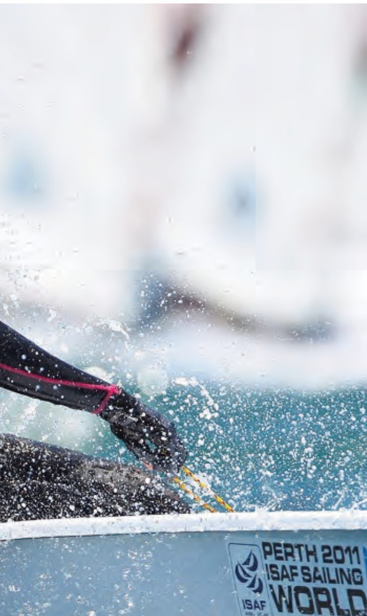
at training in Weymouth

The series starts with a 50 mile day race to Arklow on April 28, followed by a 70 mile offshore race from Dunlaoire to Holyhead on May 5 with lots more races scheduled including qualifier races