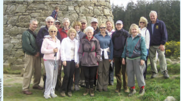
NYC Walking Group whose April walk took them from Rathmichael via Carrickgollogan to the lead mines and back