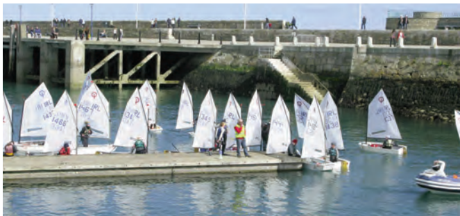
Optimist sailors coming home in an orderly manner during the Mitsubishi Youth Nationals

Firstly, we have our Nippers course starting on Wednesday nights from May 9 and forms are available on the website or from the office. Its a wonderful introduction to sailing for beginners and can often be a pleasant break in the week for their parents!