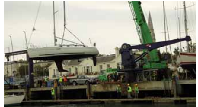
Lift Out, 2011

We have tried a few new initiatives this season too – we had 12 mums signed up for our Wednesday morning Mums Can Sail Too course which they wish to continue next Easter. They are also planning their own rib course so watch the web site for details in the new year! UCD are now doing their beginner sailing courses in the Club Toppers which may, hopefully, bring some new members in the future. The FFs held a Come & Try day recently, which generated lots of enthusiasm. They plan to hold a second of these next year for those who missed this opportunity. One of the Club 1720s has been entered into the Turkey shoot as a continuation of the Adult Sail Training programme to give members an opportunity to get some racing experience – we have used Teamers texting service to organise this so hopefully we can expand its use in the Club in the future.