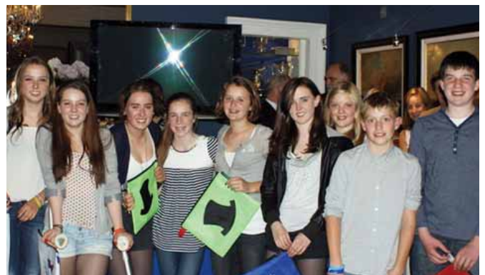
Topper sailors from NYC who competed in the Topper worlds receive their prizes at the junior dinner

The ISAFs Youth World Sailing Championships the "Youth Olympics of Sailing" will be hosted by the waterfront clubs from the July 13 to July 21. It is arguably the biggest sailing event to ever come to Dun Laoghaire. You will be hearing lots more on this shortly. The junior committee are currently working on both a social and a sailing programme, particularly aimed at families in the Club, to allow our juniors the maximum exposure to the event, on and off the water (and parents to have some fun too!). We will be furnishing details of these programmes early in the new year.