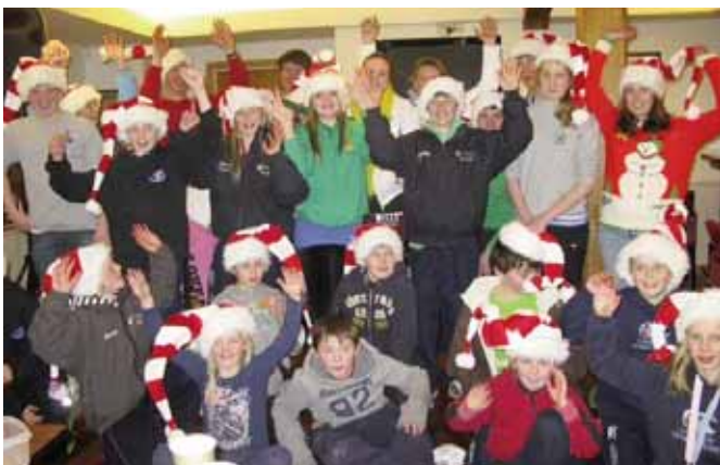
Last day of winter coaching with santa hats

Towards the end of October, we started our winter coaching series which has proved extremely successful. We are very fortunate to have a really excellent group of coaches who are working through a 12 part syllabus which allows maximum continuity heading into the spring coaching. The coaching includes our introduction to Fevas where juniors have been coming down each Sunday to try our Club Fevas. This has proved very popular!