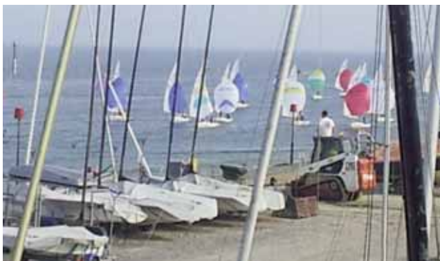
The flying fifteen worlds fleet return from racing under spinnaker at their Worlds in Hayling Island