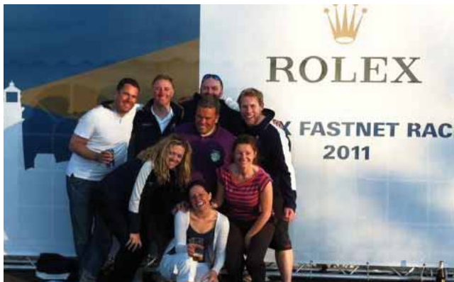
The "Intuition" crew put in a great result in the Fastnet Race