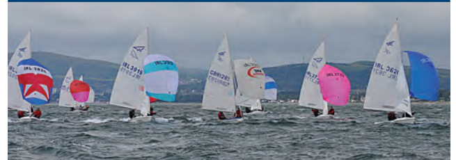
2011 Championship at Carrickfergus