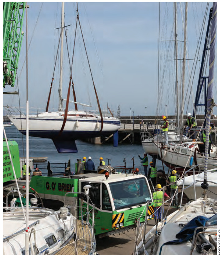
Lift-In at the National

In Dublin Bay, the DBSC continues to supply exciting and varied racing for a whole host of fleets and classes and by now the season is well under way. National sailors compete and win in many of these fleets and I wish them all great success in the 2011 season. We thank all those who volunteer their time and energy to help support DBSC.