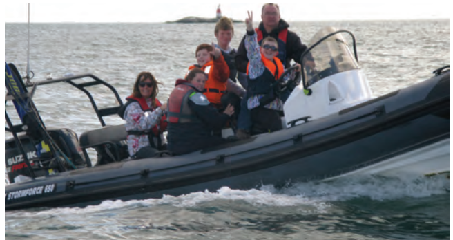
St Joseph's – Caption to come

The event will cost over a €1 million to run and while much of the funding is in place, the National Yacht Club is tasked with providing country sponsorship for a number of teams.