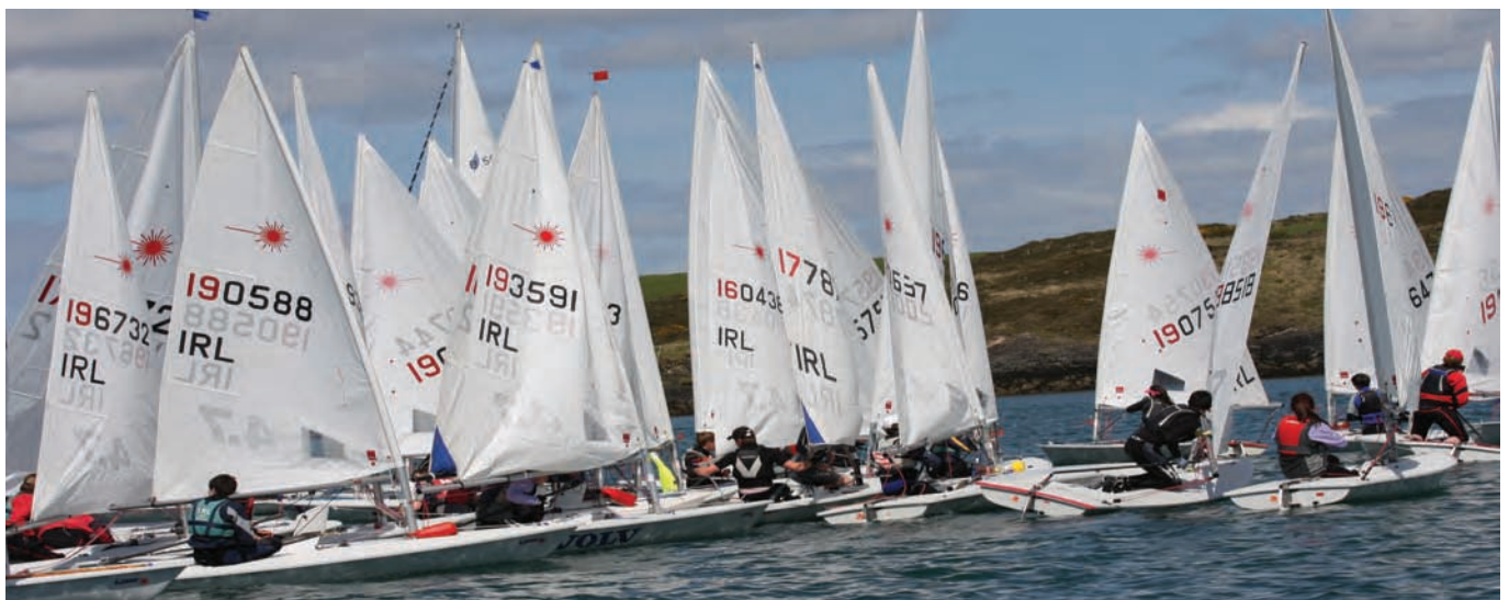
Chaos at the mark during the Laser Munsters