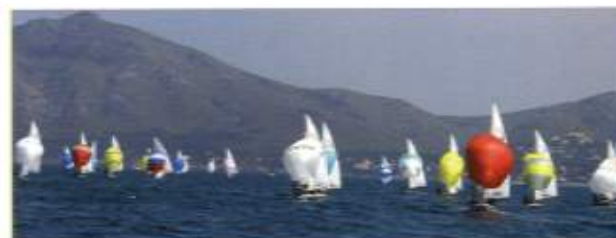
Flying fifteens at their European Championships in Mallorca

At a meeting last month, which was called to agree a common approach to the four Club Regattas this year, it was agreed to have a standard set of sailing instructions for all of the waterfront Regattas. This should make for a very smooth Race Management function for all the clubs and also assist the competitors, with the same time and format for racing at each Regatta.