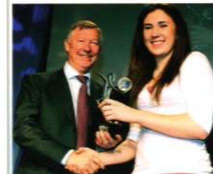
Sir Alex Ferguson, the manager of Manchester United FC presenting the Irish Examiner Junior Sports Star of the Year award to Annalise Murphy earlier this year – a very special day for our young sailors

Laser Connaughts, LDYC, June 28/29, www.laser-ireland.com .