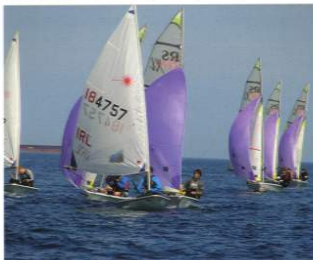
Competitors in the Earlybird Regatta

T he Sailing Calendar for 2008 has been finalised with another busy season ahead for the club. We are scheduled to host eight major Championship events. The highlights are our own Club Regatta in June and the SB3 World Championships in September.