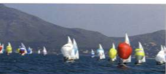
Club members competing at their European Championships in Mallorca

At a meeting last month, which was called to agree a common set of instructions for the four Club Regattas this year, it was agreed to have a standard set of sailing instructions for all of the Regattas. This should make for a very smooth Race Management function for all the clubs and also assist the competitors, with the same time and format for racing at each Regatta.