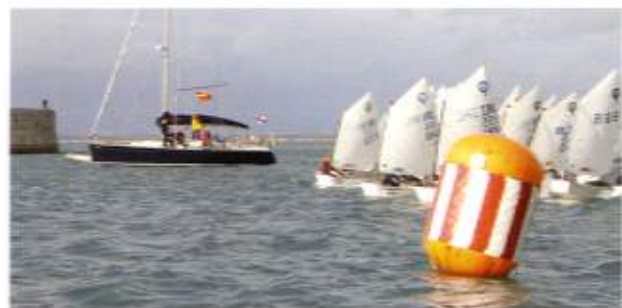
What a start! Gorman Trophy - October 30, 2007

Have you noticed how many big freighters now share the Bay with you? Stella Maris, the old Dublin charity, part of the work of the St Vincent de Paul, has a premises near Busaras in the city open in the evenings.