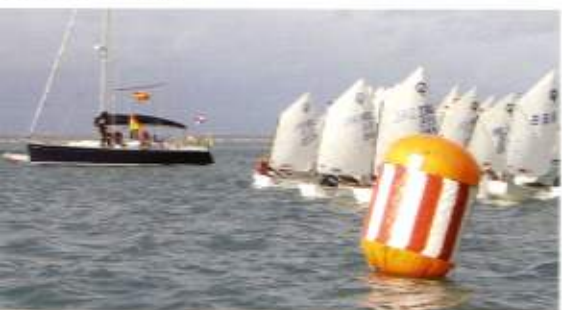
What a start! Gorman Trophy - October 30, 2007

Have you noticed how many big freighters now share the Bay with you? Stella Maris, the old Dublin charity, part of the work of the St Vincent de Paul, has a premises near Busaras in the city in the evenings.