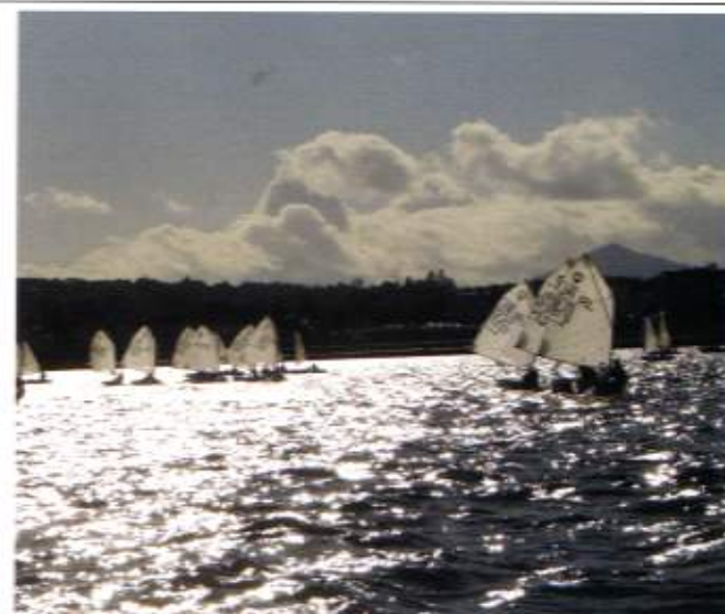
The Sugarloaf providing a scenic backdrop to evening racing