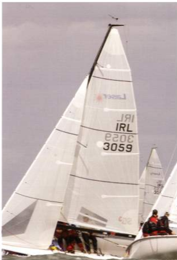
'Backless 11' of NYC (helm Gareth Nolan) crossing just ahead of HYC boat Helly Hansen (helm Tom Fitzpatrick) in race two of the SB3 National Championships

We were very pleased to finish 5th overall and win the French National Classic. We got a trophy and champagne (and a Sinead O'Connor CD). Also we got best visiting boat and another bottle of bubbly. We had 5, 2, 11, 4, 6, and 8.