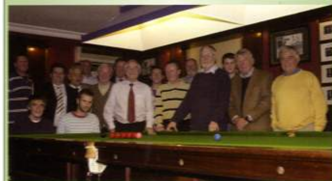
National and Royal St. George Snooker Teams

The Snooker Season is now well in its stride with the McWilliams competition approaching the last eight. Watch out for all the black ball finishes illustrating the expertise of handicapping. The final will be played on the night of the Preston Ball Auction Dinner on Friday 11th January 2008, so make sure your winter sun or ski break does not conflict with this date. As usual, this will be the zenith of the snooker season, being the starting gun for the Preston Ball Trophy.