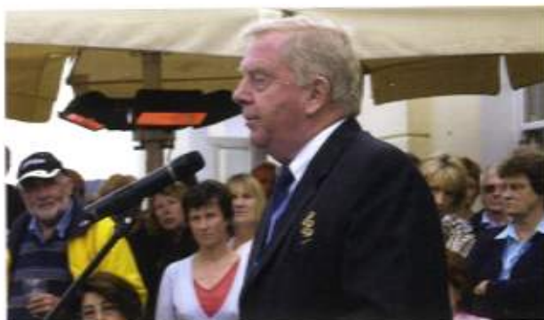
Goran Petersson, President of ISAF, addressing the opening ceremony from the NYC balcony

Each evening several hundred spectators watched, providing a noisy and boisterous background with fun for all. After two evenings and countless preliminary races, the racing culminated in a best of 3 match race final which was won emphatically by