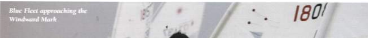
Blue Fleet approaching the Windward Mark