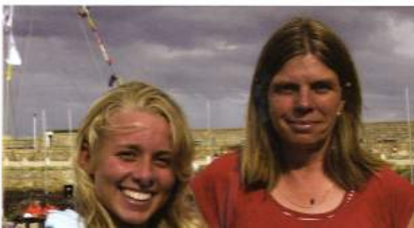
An exciting start to the Laser 4.7 European Championships