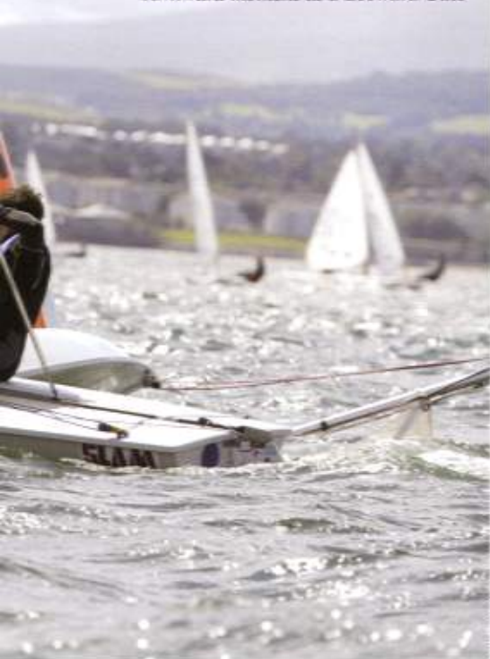
Awkward moment at a Leeward Gate