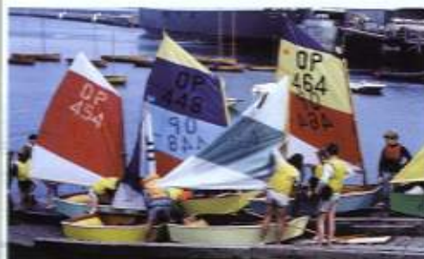
The National YC first Junior section rigging their new Optimists on the Club's original slipway with the East Pier car ferry terminal in the background.