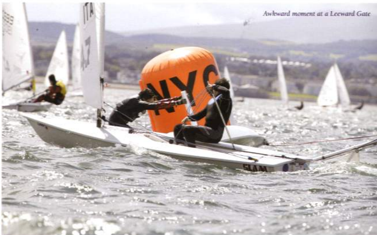
Awkward moment at a Leeward Gate