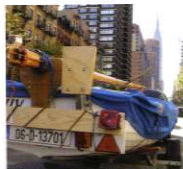
This photo of "Dolly" was taken downtown Manhattan after been pulled over by a traffic cop near the UN building, wondering about the number plate. You will note "Dolly" is in cruising mode with an engine bracket fitted

Though no performance differential with the traditional wooden boats was manifestly demonstrated over the two years of the project, rejection by a very small majority by The Mermaid Sailing Association prevented integration of these new boats into the existing all wood fleet. The emergence of the Laser SB3 as a major force in Ireland and the defection of two leading former Mermaid Champions to this new class was the final blow at attempts to revitalise the Mermaid Class with the