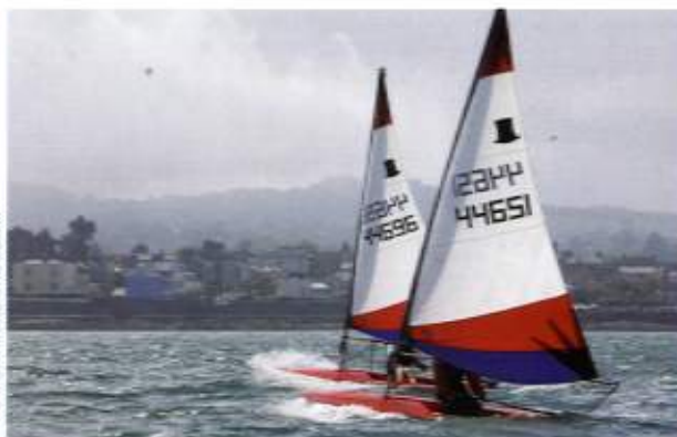
NYC Toppers in action