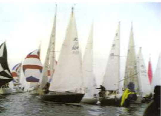
Sailing at the weather mark

Club will host a number of events this season, including national championships. Of course, as reported before, the final National Yacht Club Regatta will be replaced this year by the inaugural Dun Laoghaire Regatta Championship, which we will co-host with our three neighbouring Dun Laoghaire clubs from July 7 to 9.