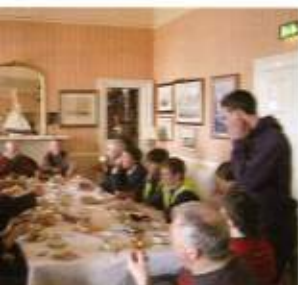
Lift-in team taking a well-deserved break for lunch