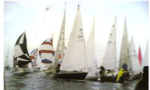
Bunching at the weather mark

As I write, reports are coming in that the National Yacht Club members also did well in the Flying Fifteen West Coast Championships held at Mayo Sailing Club Westport on May