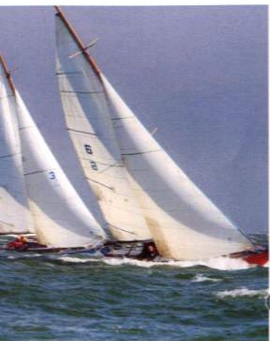
Race in action – Harmony and Euphanzel racing in Dublin Bay

In 2003, two Irish yachting enthusiasts approached the club with a proposal to buy the entire fleet, refurbish each boat and bring the fleet intact, to sail in classic boat regattas and events in the South of France where interest in this type of craft is high. Recognising that this was probably the best way to ensure a future for the fleet as a whole the owners after a long and soul searching, accepted the proposal. The boats will be handed over at the end of the current season.