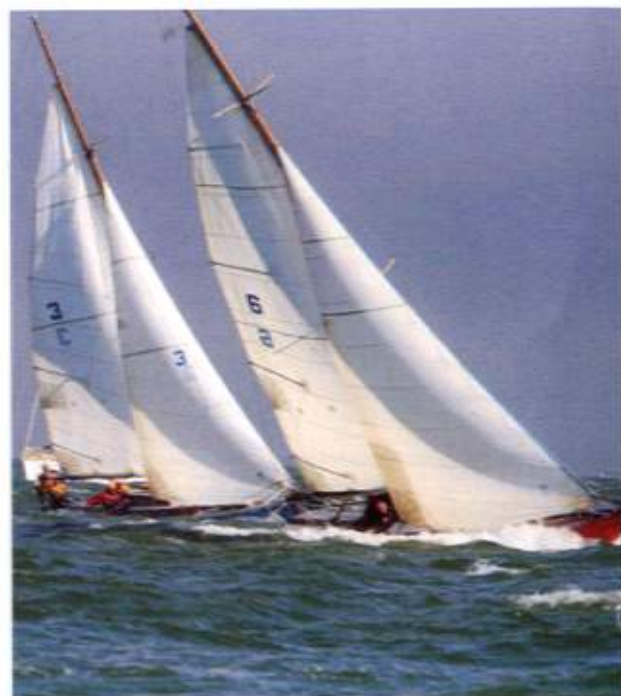
Elegance in action – Harmony and Euphanzel racing in Dublin Bay

Through the past five years the owners had mounting concern, not only at the high and ever increasing cost of maintenance, but also at the lack of interest in classic boats, particularly amongst younger sailors. The difficulties in keeping a small fleet together and sailing competitively, and the rise and popularity of many modern classes led to concern that if even one of the five ceased racing it would spell the end of racing 24s as a class in Dublin Bay, and the subsequent disintegration of