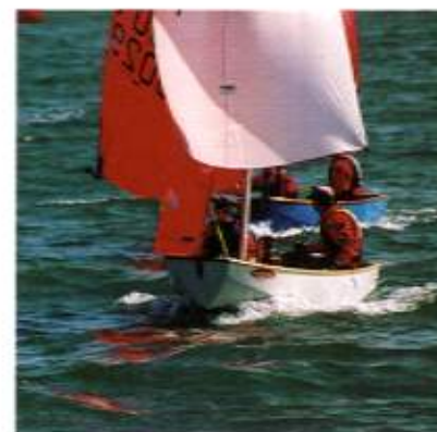
Mirror Spring Regatta, March, 2003

Following Lakota's record, in order to broaden the scope of 'Round Ireland' record sailing, Cork Dry Gin put up an additional trophy, solely for monohulls: the Cork Dry Gin Round Ireland Monohull Record Trophy. This is the trophy that the Irish Independent crew were recently awarded following their breaking of the Monohull record with a time of 75hrs, 53 mins and which is now also on display (temporarily) in the dining room.