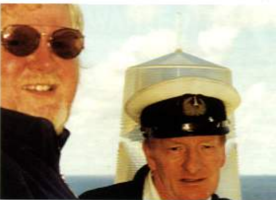
The author with the lighthouse keeper on top of Tory Island lighthouse

As regards the storm, it blew force 9/10, rising to a crescendo on Tuesday morning at 7am. There is a new £7m pier on Tory and the waves were coming over the top and breaking like sledgehammers on the coach-roof of our little boat. Before the pier was built the islanders had to take their boats out of the water in a storm or run in advance for shelter to Bunbeg. The storm raged all day and then calmed to 5/6.