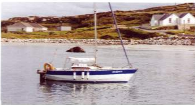
E-boat at anchor, Arranmore Island

The E-boat is a very beamy (9ft) 22 long foot lift-keel which I chose for its performance and also the ease of getting it in and out of the water in a location where there is no crane available for 50 miles. About 250 E-boats were made in all from 1978-1984 and there is a strong class association (see www.ritchie.157.freemove.co.uk ). Fleets race at several locations in the UK and in particular at Port Edgar on the Firth of Forth near Edinburgh. About 8 E-boats race out of Clontarf Yacht Club. I had bought mine earlier in the summer in Port Edgar. It was one of the last made with a raised coach-roof.