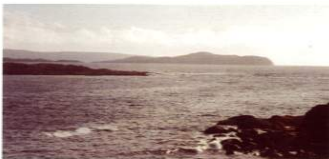
Off the stern ... Cruit, Owey with Arranmore in the distance and Inisfree nearest

short on everything, in particular toothbrushes, clothes and money, but we had to make the best of it.