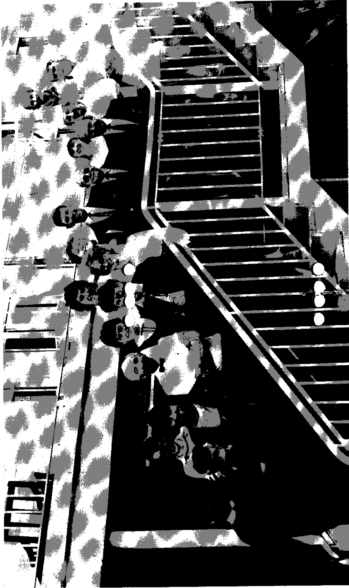
SALUTE TO OUR STAFF

"Up Helm!" is proud to be given the task, on behalf of the NYC and you the members, to present and to recognise our staff. The level of warmth, friendliness and service which we enjoy and have enjoyed down the years, is a source of pleasure to us and of wonder to our visitors, whether they are sailing, social or business. The recent visit of Robin Knox-Johnston and his entire British Airways I team, highlighted this. They were unanimous in their acclaim and we join them in saying a sincere "THANK YOU" !