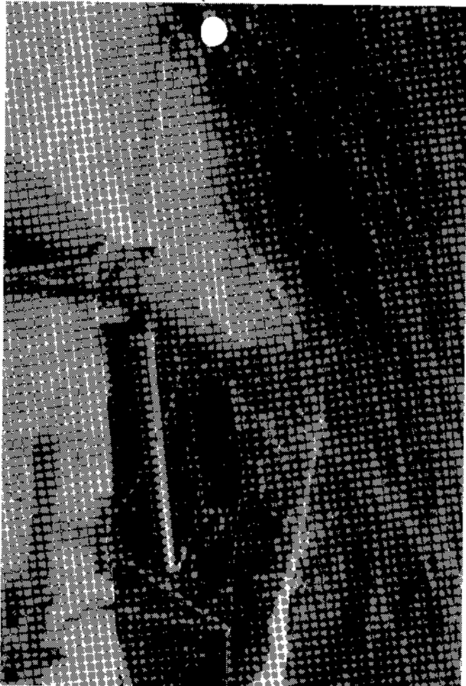
"How the Mighty are Fallen"

British Airways have not donated a perpetual trophy for this event, to be administered by the National in recognition of the work we have done. The trophy will be for the fastest time around Ireland and its' offshore islands (excluding Rockall!!!), in any boat under sail in either direction. The trophy is to be named the "Concorde" contd. XII