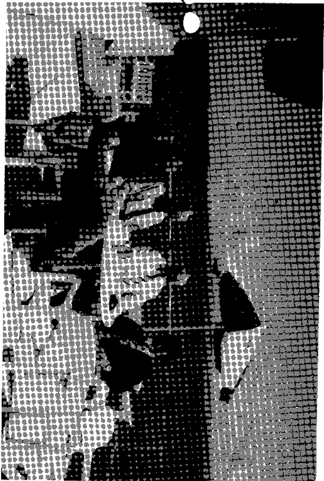
The Calm after the Storm