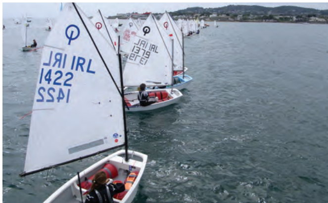
Optimist fleet start at the NYC 2010 Junior Regatta

Our Junior and Youth programme is the single biggest and most important section of sailing in the Club. Many of our Junior and Youth sailors competed with great success at championships at home and abroad at the European and UK Optimists Championships and the Laser, Feva and Topper World championships.