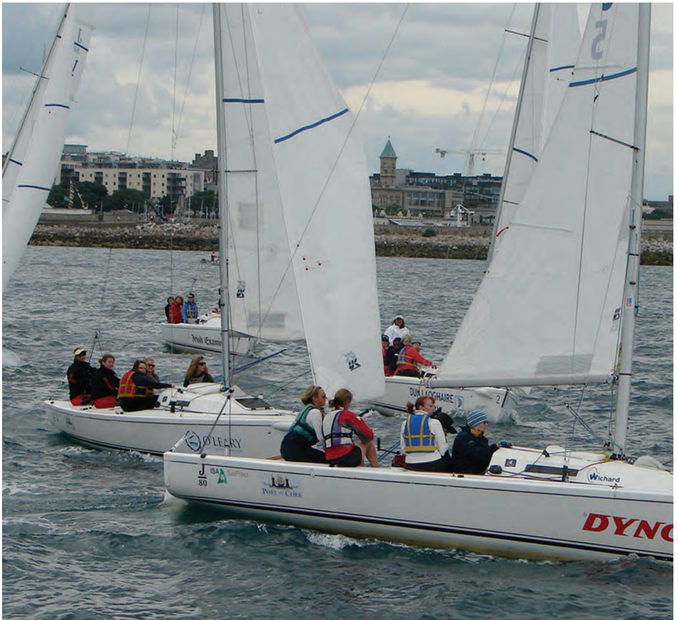
J80 fleet approaches the start line during the WOW (Women On the Water) day on Sunday, July 11

In Howth Yacht Club's Lambay Race, Philip Dilworth in Orna won the prestigious "Lambay Lady Trophy".