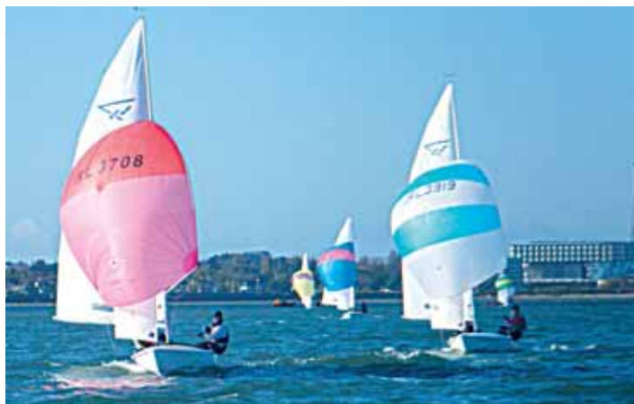
Flying Fifteens competing in the Cantrell & Crowley NYC Frostbite Series

The Club is being represented at the highest international levels by one of our young Cadet members, Annalise Murphy. Her win this year in the Laser Europa Cup, her 8th place in Female Laser Radial Worlds and her win in the Under 21 World Championship have put her well on the way to qualify to represent Ireland in the next Olympic games. While some funding is available to her from