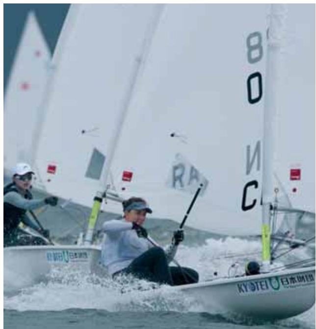
Annalise Murphy in Japan

I headed out to Japan expecting light air conditions, but soon realised that we could get any condition. We went out for the practice race and after doing split tacks came to the conclusion that there was more wind coming off the cliffs on the right-hand side of the course. I lead the practice race for the first three legs before heading in (as its bad luck to finish a practice race!).