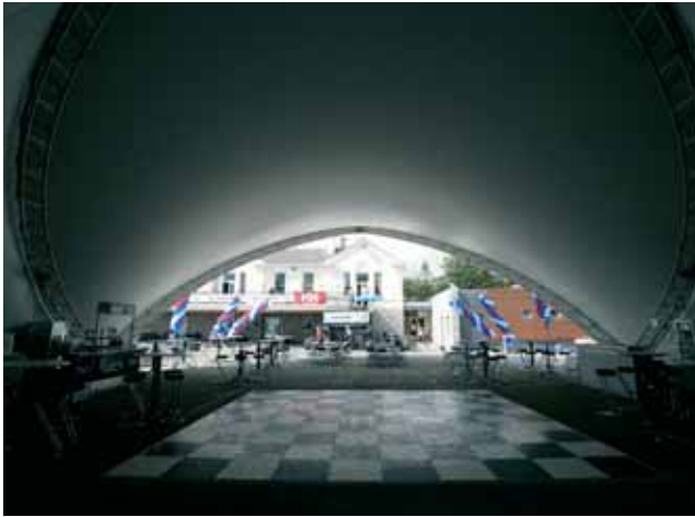
Eyelid marquee in NYC for Prize giving at Volvo Regatta

The summer sailing season of 2009 is fast drawing to a close. Despite the mediocre weather we had, the year has been very successful for sailing events in the National Yacht Club and for our members.