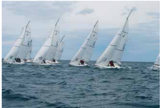
J80 Corporate Cup