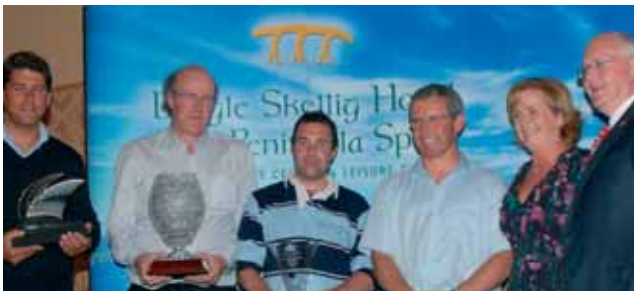
The winning crew of Legally Brunette at the Dingle prizegiving