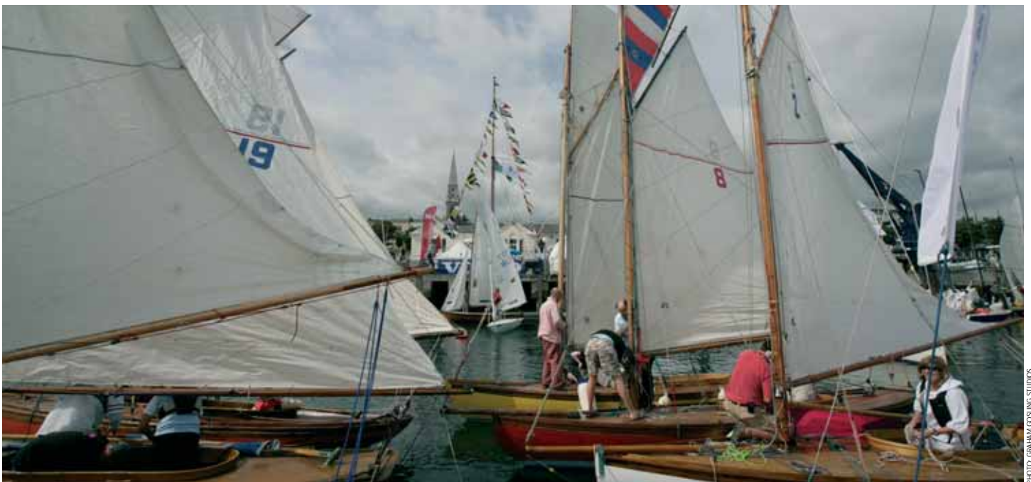
Old friends, Howth 17 Fleet welcome visitors to the National during the Dun Laoghaire Volvo Regatta

A measure of the success of the Club is the level of activity that takes place in the Club and the number of members who are involved in these activities. I ask all members to get involved in the Club and to use the fine bar and dining facilities.