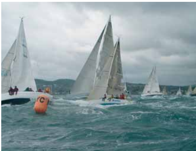
Dun Laoghaire to Dingle start off the 40 foot