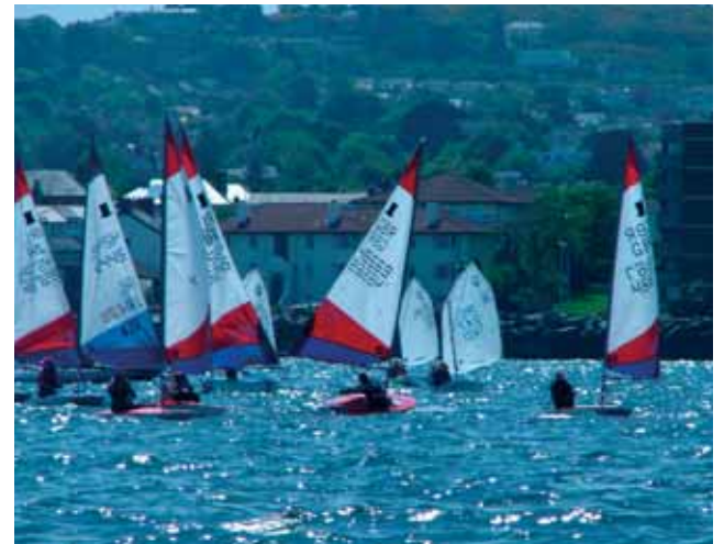
Toppers and Optimists racing at the Mitsubishi Youth Championship on May 8.

This summer has been a very busy one for our junior section sailors and also for our competition sailors. The NYC Optimist Squad has gone from strength to strength.