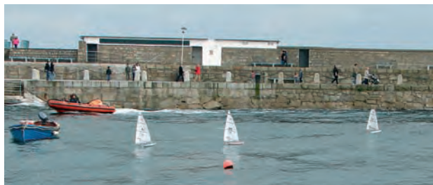
NYC Laser radio controlled fleet racing – Sunday, March 28, 2009