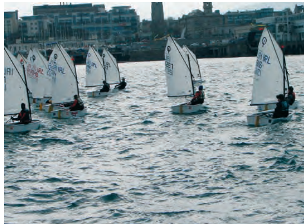
Grand Slam Optimist fleet start – March 28, 2009

So it was a draw at two matches all. But, on countback, RHKYC won by a single point! So the crystal trophy went back to Hong Kong. They have indicated that they might have a return match in Dublin Bay in the next 2 or 3 years. When they come, we will really have to pull the stops out if we are to match what they gave us!