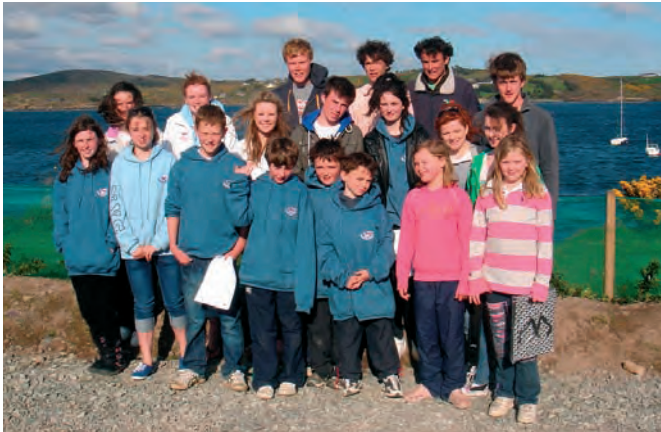
National Junior Sailors after a fun week at the ISA Youth Championships in Schull, Easter 2009