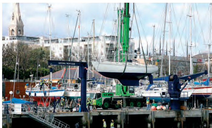
Lift-in at the National

As set out above there is a huge sailing and social program