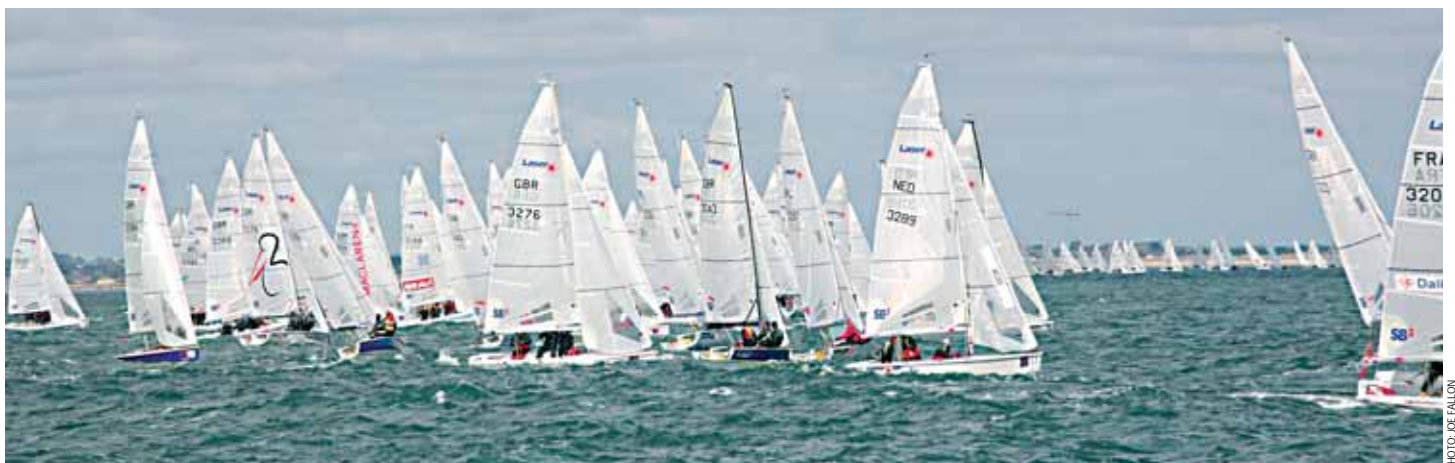
Dublin Bay covered in SB3s!