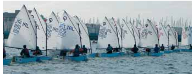
Optimists competing for the Gorman Trophy

We also plan to run Minor courses for our 7-9 year olds concurrently.