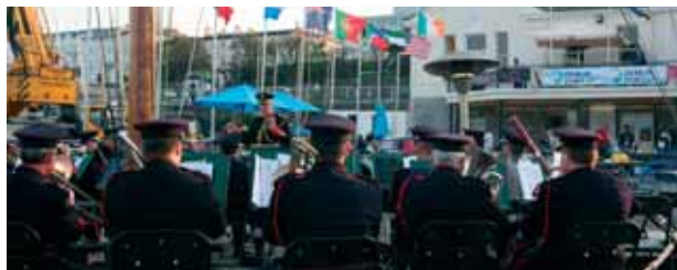
Army No. 1 Band at the Closing Ceremony