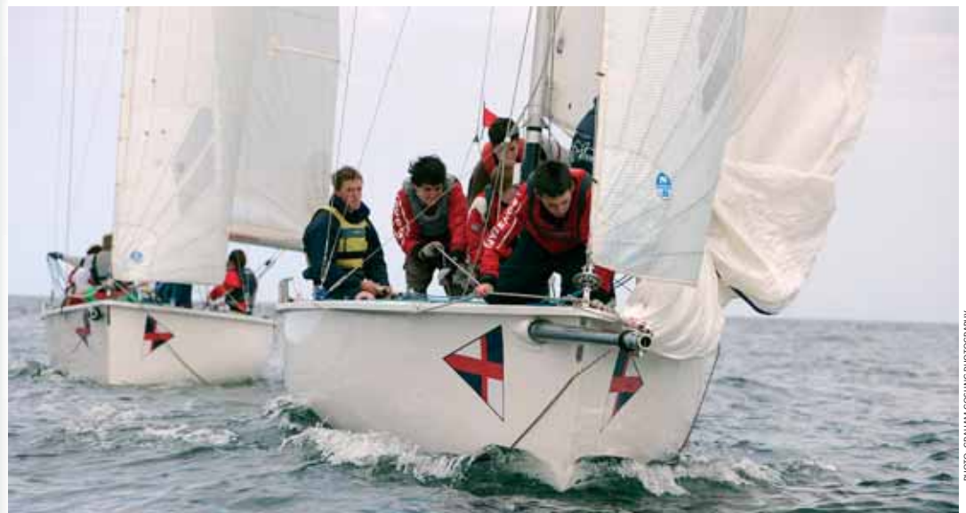
NYC Juniors sailing the Club's 1720s during this summer's Junior Training Programme

National Yacht Club Dun Laoghaire, Co. Dublin. Tel: 280 5725 Fax: 280 7837 email: nationalyachtclub@eircom.net website: www.nyc.ie