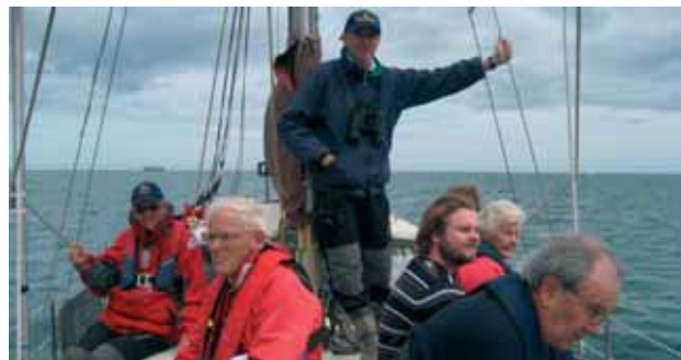
NYC volunteers during the Shipman Championships