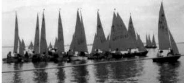
Red sails in the sunrise