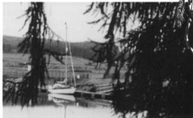
Gairlochy, Caledonian Canal

time in getting quickly down through Corran Narrows under engine with a good tide, and tying up at Kerrara for the night.