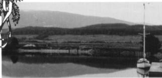
Peace and quiet, Gairloch, Caledonian Canal